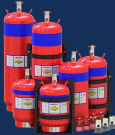
Fire Suppression System