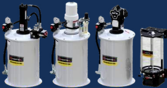
Auto Lubrication System