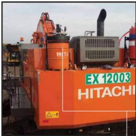
Hartex Hydraulic Grease Pump installation on EX-1200

Hartex Automatic Lubrication System delivers precise and proportional amounts of lubricant at regular intervals, ensuring that every component requiring lubrication maintains an optimal grease film at all times.