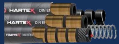
Hose & Fittings