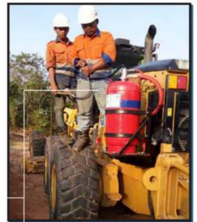
Hartex Fire Suppression system installation on EX-1200 & GDT-008