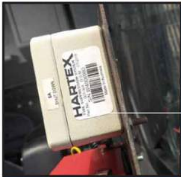
Hartex Panel Alarm installation for Fire Suppression System

Hartex Fire Suppression System has been launched after an extensive review and enhancement of our highly successful previous series of vehicle fire suppression systems.