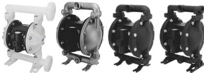
Pneumatic Diaphragm Pump