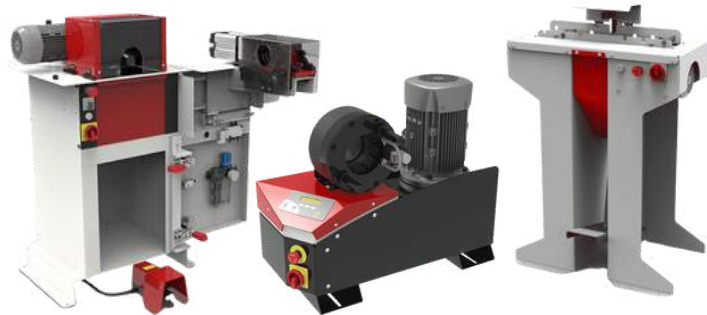
Hose Assembly Machine